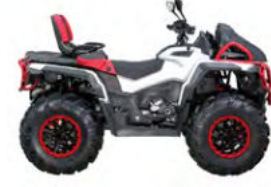
PATHCROSS 1000 MUD LX