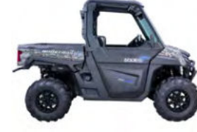
WORKCROSS 1000-3 MUD (SNORKEL LIFT UP)