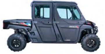
WORKCROSS 1000-6 TEXAS BOUNTY EDITION