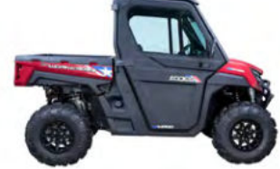
WORKCROSS 1000-3 TEXAS BOUNTY EDITION