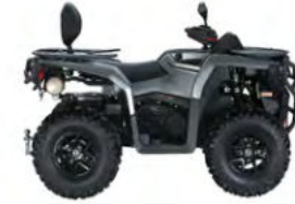
PATHCROSS 550 S/PRO L