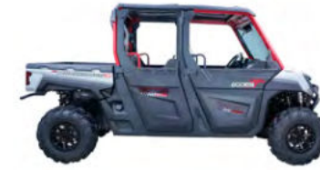
WORKCROSS 1000-6 MUD (SNORKEL LIFT UP)